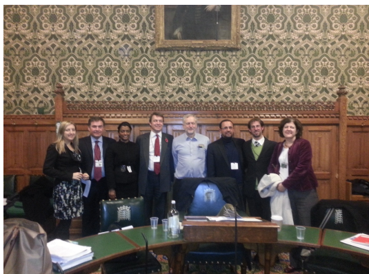
Jeremy Corbyn MP with BHRC delegation members