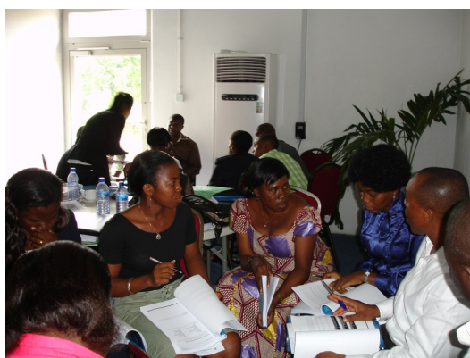
Practical group sessions at the Calabar training.

This project not only comprises the roll out of 5 training phases across the country, but also the development of three comprehensive Training Manuals . The Child Rights Manual and its accompanying Training Manual and Case Materials Manual provide a detailed and practical guide to