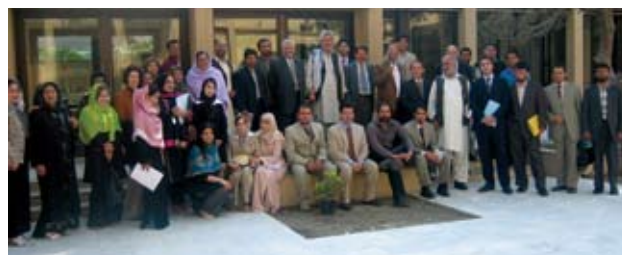
Some of the participants and trainers from the Rule of Law Workshop 2006

A training manual was produced to complement the programme. The training manual can be found on the BHRC's website http://www.barhumanrights.org.uk/docs/TrainingmanualAfghanistan.doc