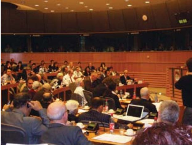
Participants at the 4th annual EUTCC Conference on Turkey at the European Parliament in 2007

The 2006 Conference focused on implementing a solution to the Kurdish Problem—the most difficult issue for Turkey in its bid to develop democracy. The