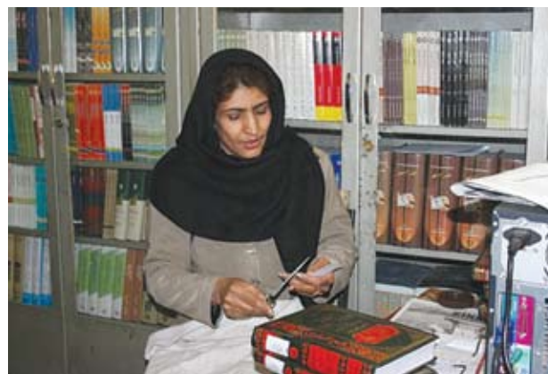
Librarian in the Supreme Court in Kabul cataloguing the BHRC/FCO funded books.