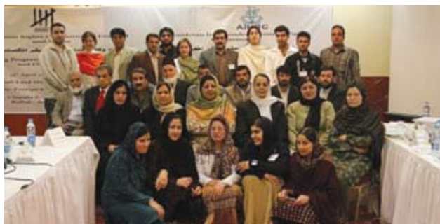
Group of Participants and Trainers in April 2007