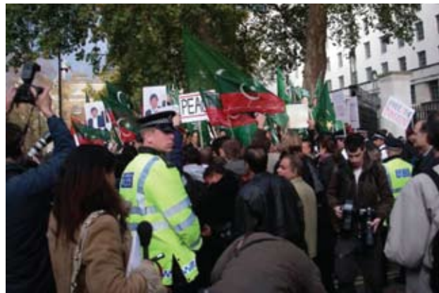
Demonstration outside 10 Downing Street for the Restoration of the Judiciary in Pakistan

The BHRC arranged interviews with the press including the BBC, Channel 4 news and More4 News. The Committee also helped to organise weekly candlelight vigils outside the BBC's Bush House to express its solidarity with the legal profession in Pakistan. The vigils were held every Tuesday between 4.30pm and 5pm in the hope that Pakistan would free the media, the judiciary and help restore democracy.