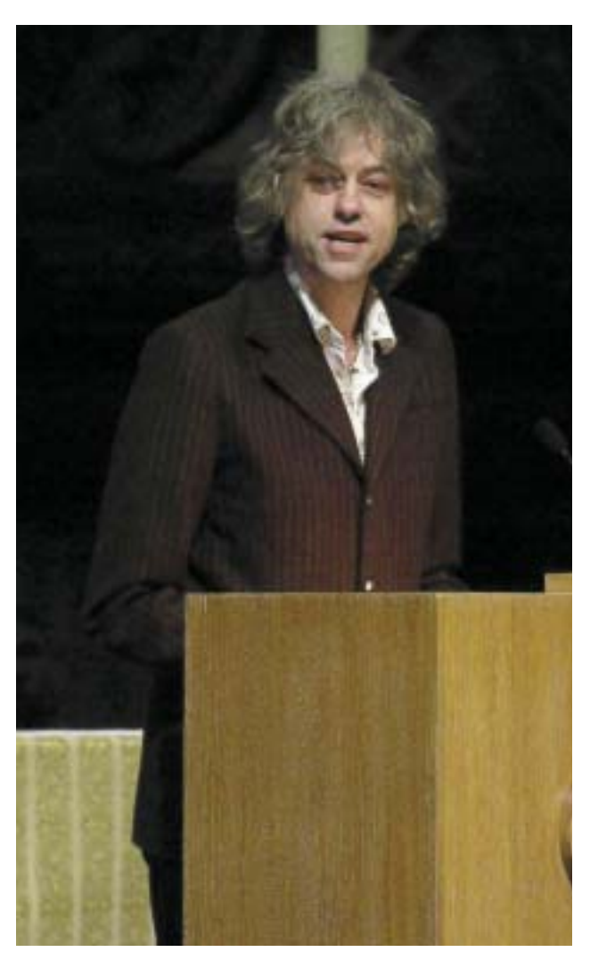
Sir Bob Geldof, BHRC Biennial Lecture, St. Paul's Cathedral, London

(and a wider group of decision makers) of the current application of the death penalty in Africa; reinforcing human rights values within the legal systems; exploring all possible