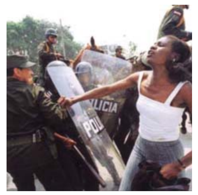
Trade Unionists, Colombia

BHRC has continued to monitor the Americas and the Caribbean and held a number of meetings in London with visiting dignitaries including the Bolivian President of the Supreme Court of Justice, legal representatives and human rights activists from Argentina, Bolivia, Colombia, Guatemala and Peru. We have sustained our work in Colombia and sent a fact-finding mission there this year in collaboration with the International Centre for Trade Union Rights (ICTUR). In London, we met with the Vice Minister for Defence for Colombia and participated in a conference on Colombia held at Chatham House.