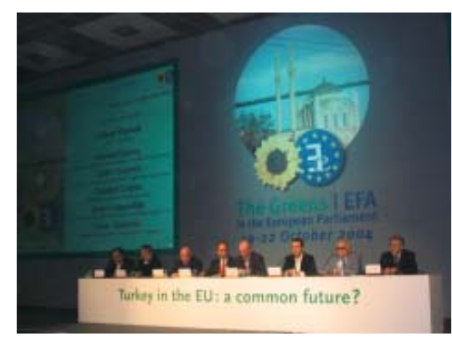
EU Accession Conference, Istanbul, Turkey

BHRC has conducted several trainings on the European Convention on Human Rights (ECHR) and international law. We carried out three days of judicial training in Ankara together with experts from Jamaica and Norway on the international law against torture and methods for combating torture which was attended by more than 100 Turkish judges and Prosecutors. We implemented 2 days of training on the ECHR and UN mechanisms on human rights in Istanbul and Diyarbakir which was attended by 35 people from the Diyarbakir Bar Association, the Human Rights Association Diyarbakir Branch and Contemporary Lawyers Association Diyarbakir Branch.