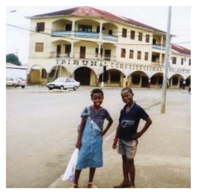
Constitutional Court, Malabo, Equatorial Guinea