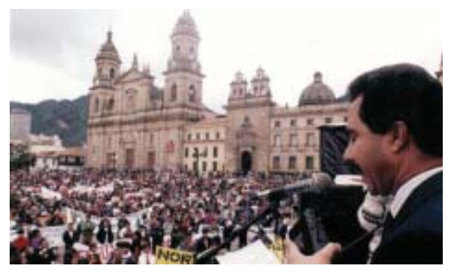
Demonstration of Trade Unionists, Bogota, Colombia