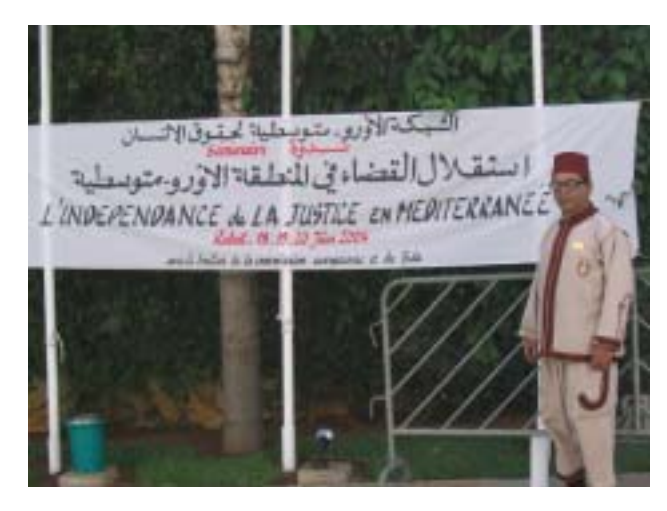
Euro-Mediterranean Human Rights Network Workshop, Rabat, Morocco

Most of BHRC's efforts seek to inspire, organise, inform and extend the work within the legal sectors of countries as we strive toward the common goal of protecting the human rights of individuals across the globe. We believe that international human rights standards apply to all people equally and we will continue to develop our work and engagement with legal and human rights communities throughout the world to achieve real progress.